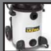
Rugged stainless steel tank