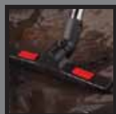
Wet pick up