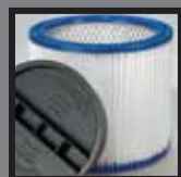
HEPA filtration for fine dust and particles