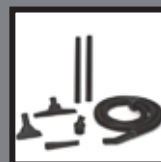
Accessories for wet/dry messes