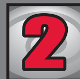
2 year warranty